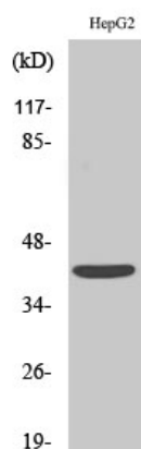
Western Blot analysis of various cells using EDG-6 Polyclonal Antibody